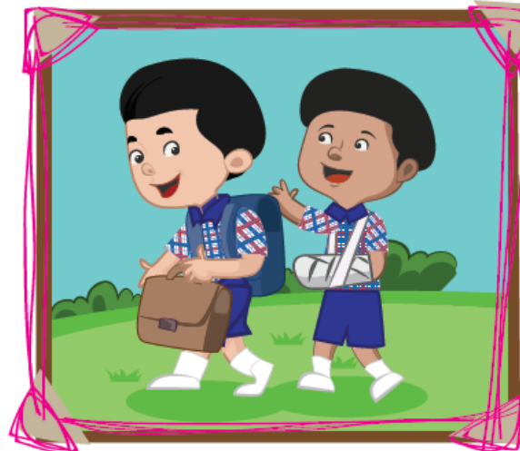
Help Your Friends And Encourage One Another