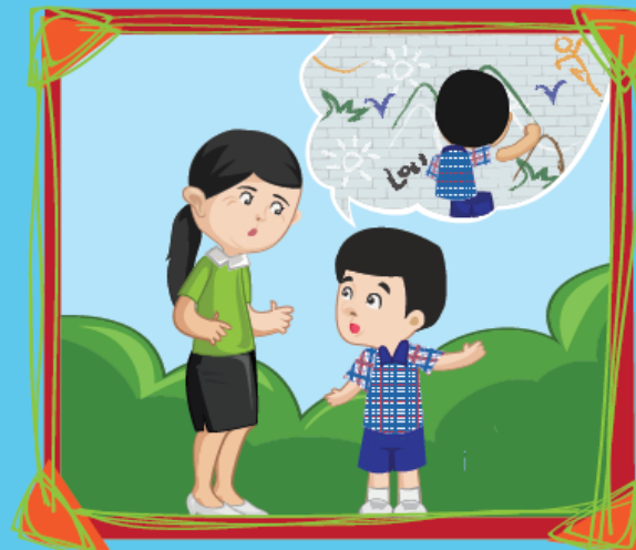
Stand Up For What Is Right