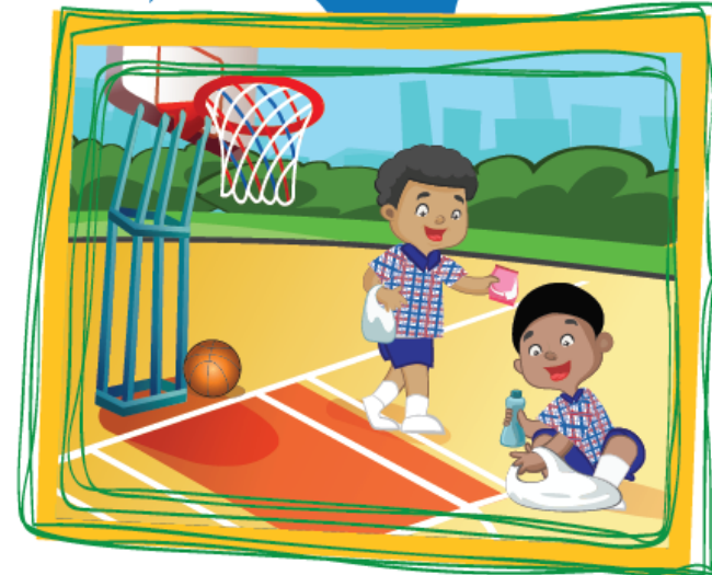
Do Your Part For The Environment