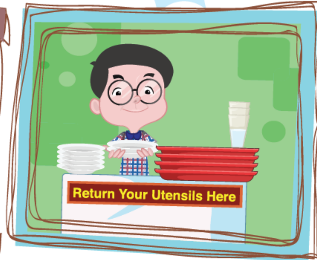
Be Socially Responsible