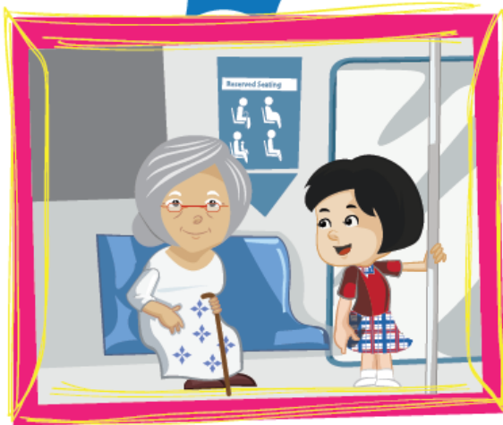
Be Thoughtful And Care For Others