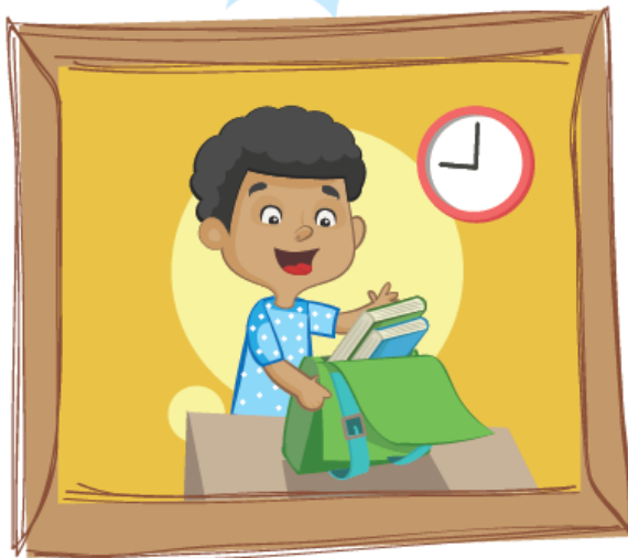
Take Care Of Yourself And Others