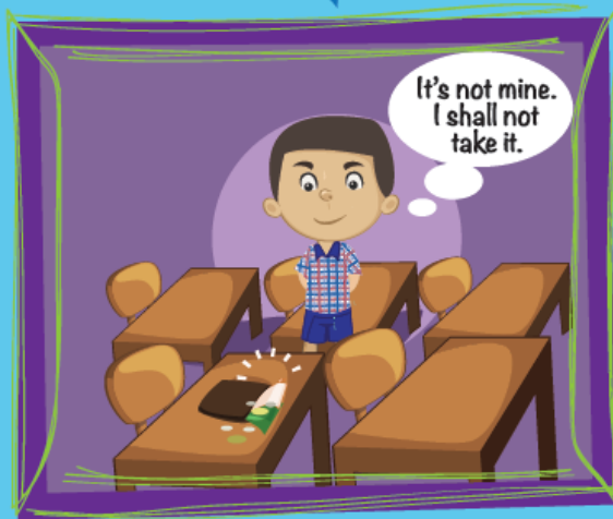
Do The Right Thing