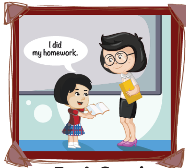
Be A Good Role Model